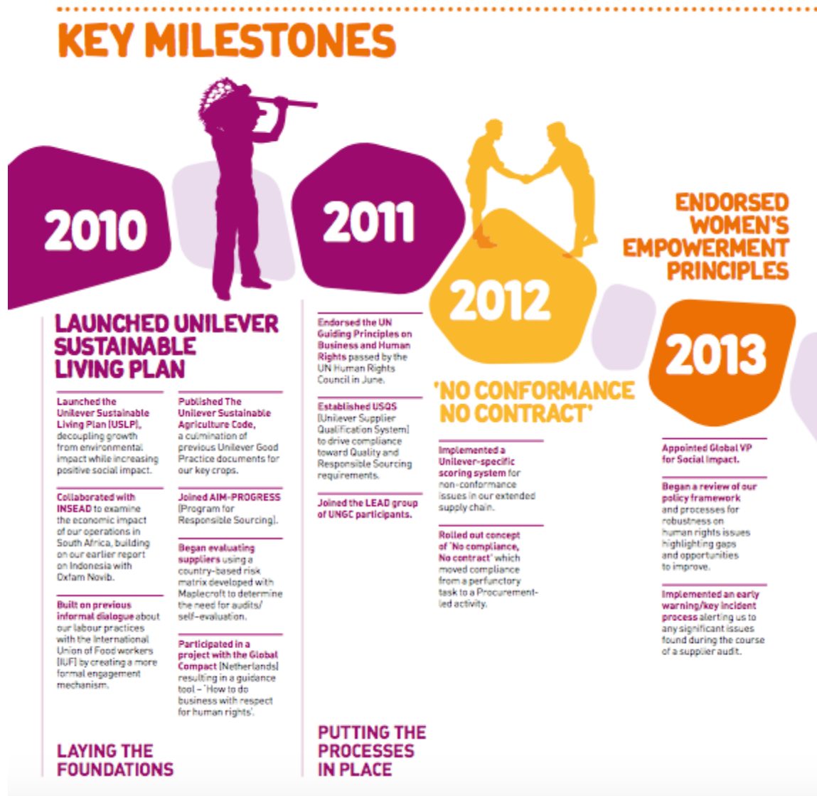
Figure 7.2- Key Milestone of HUL with Regards to Human Rights 247